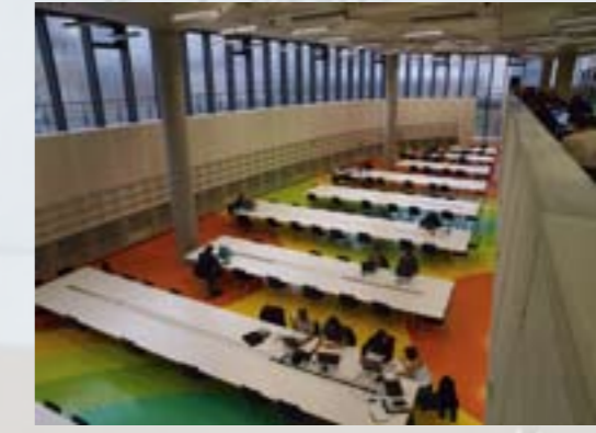
National Technical Library (NTK) http://www.techlib.cz/en/

The National Technical Library (NTK) in Prague in the Czech Republic is the central professional library dedicated to science and technology. The NTK aims to collect grey literature and to complement the role of the National Library of the Czech Republic, whose main task is to collect and preserve "white" literature. The NTK was the only active contributor and national coordinator of the SIGLE activities in the Czech Republic, but the SIGLE finished its activities in 2005. After the termination of the SIGLE, the NTK began with an initiative of collecting grey literature at the national level.